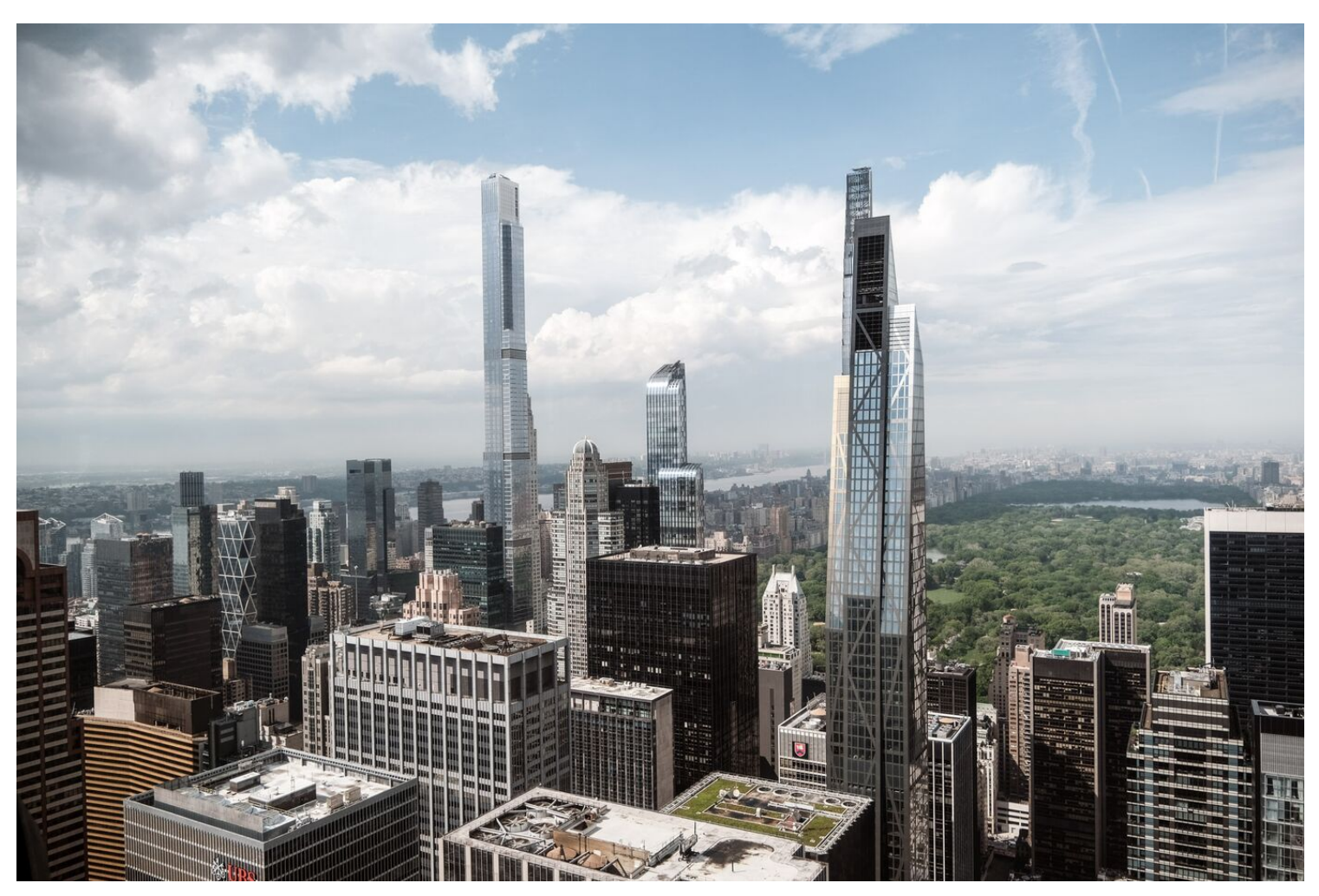
Luxury residential towers along Billionaires' Row in Manhattan.

Some of the first quarter's biggest contracts came after significant seller discounts, which helped get the market moving.