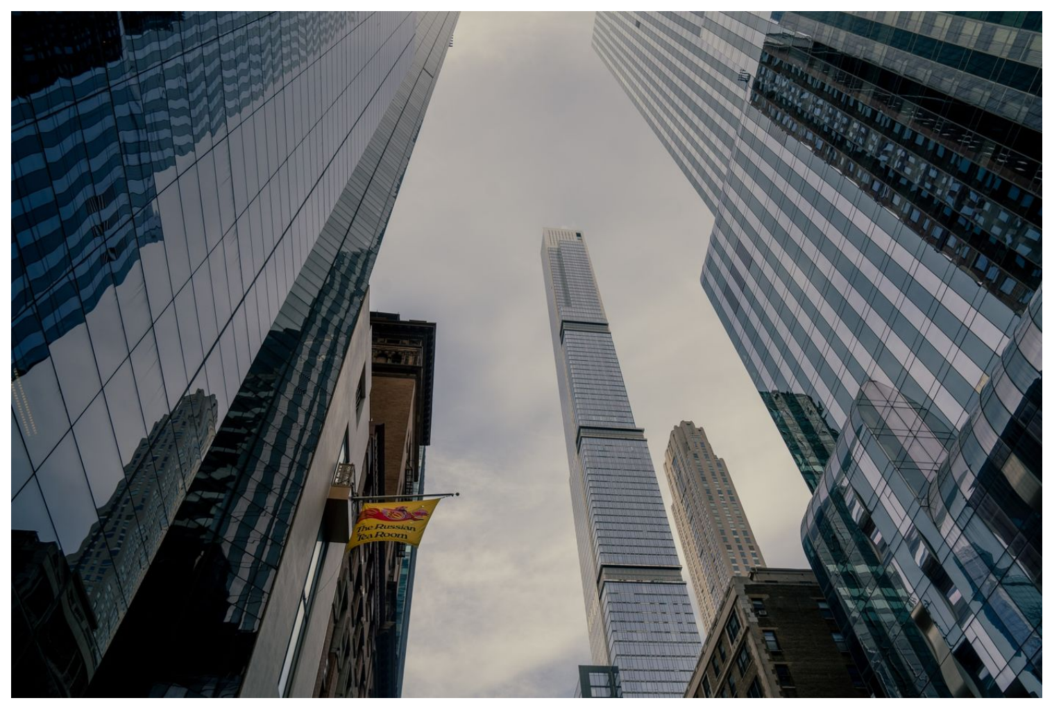
Central Park Tower, center.

On Billionaires' Row, Extell Development sold off six apartments at the 179-unit <u>Central Park</u> Tower with list prices ranging from $4.5 million to $63.5 million. Discounts for purchases that closed in the past two quarters went as high as 17.8%.