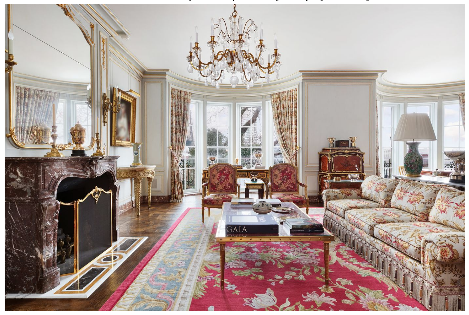
7 Sutton Square

The contract numbers point to luxury demand rebounding from a tough end to 2022. In the first quarter, closed sales at the top 10% of the market were down 38% from a year earlier, when buyers sprinted to get ahead of rising interest rates, according to a report Tuesday by appraiser Miller Samuel Inc. and brokerage Douglas Elliman Real Estate. The data reflect contracts mostly signed toward the end of last year. The median luxury sales price, meanwhile, fell 13% to $5.65 million.